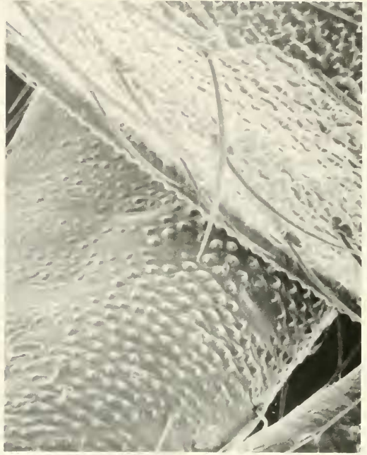
Fig. 2. Carvalhoisca jacquiniae , costal margin of hemelytron showing stridulitrum and hind femur showing plectrum.

Female (means followed in parentheses by ranges, n = 20 ): Length, 1.72 (1.62–1.84); width, 1.03 (1.00–1.06). Head length, 0.16 (0.14–0.20), width through eyes, 0.80 (0.78–0.82); vertex width, 0.40 (0.38–0.42). Length of antennal segment I, 0.19 (0.18–